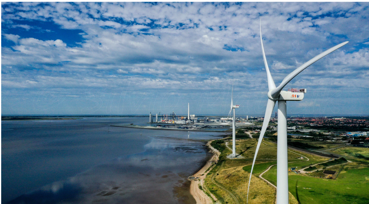
Vestas V164 9.5MW Wind Turbine

How long will it take for this wind turbine to pay for itself at this rate?